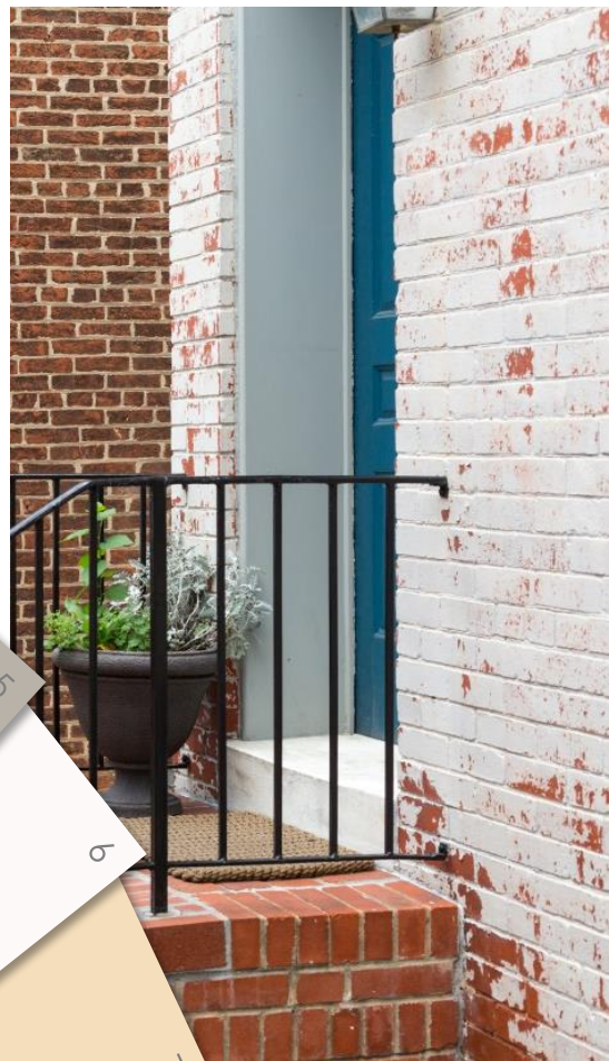
Color: 10000 Bianco Cristallino Technique: Wash Away/Distressed