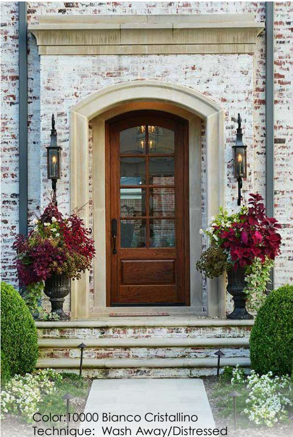
Color: 10000 Bianco Cristallino Technique: Wash Away/Distressed