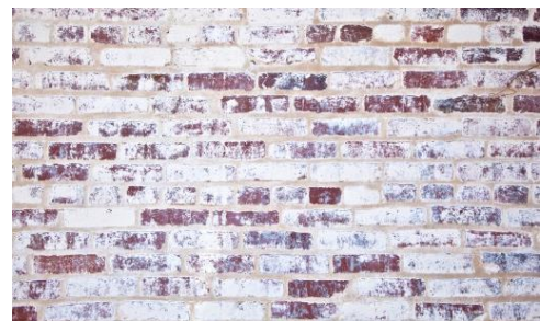
WASH AWAY FINISH: Thin Limewash 50% and apply to cover the surface and dry overnight. Apply a second coat, if desired and let dry 12—24 hours. With a garden hose and nozzle, wash away as much as desired. Color: 10000 Bianco Cristallino