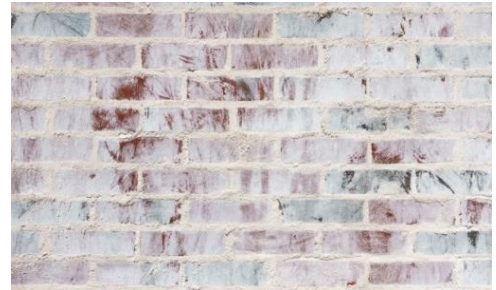
BRUSH-ON TECHNIQUE: Thin Limewash 100% and applied as a translucent wash with a wide natural bristle brush to create a random, irregular washed appearance. Color: 10000 Bianco Cristallino