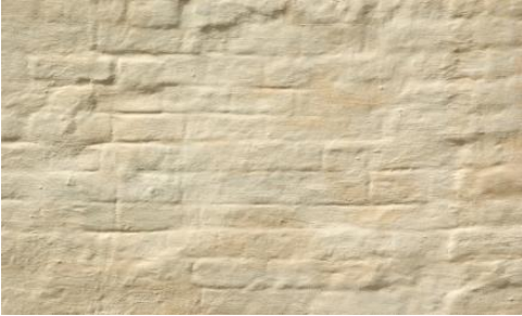
SOLID FINISH: Apply Limewash in multiple applications, each layer thinned to a different degree and randomly applied with a wide natural bristle brush to create a mottled, tone-on-tone opaque finish. Color: 19039 Splendere la Luna

Perhaps the most intriguing aspect of Limewash is how it can be applied in any number of ways to result in very different looks. From a chalky and extremely flat appearance that completely hides the surface beneath, to a two-toned almost faux finish like appearance, almost nothing is out of the realm of possibility. And think Limewash to achieve beautiful wash techniques that enhance and highlight the original masonry surface or antique and distress the finish to make the surface look as though it has been aged for decades or even centuries, even if the finish was applied yesterday!