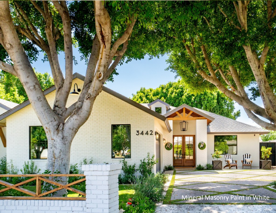
Mineral Masonry Paint in White