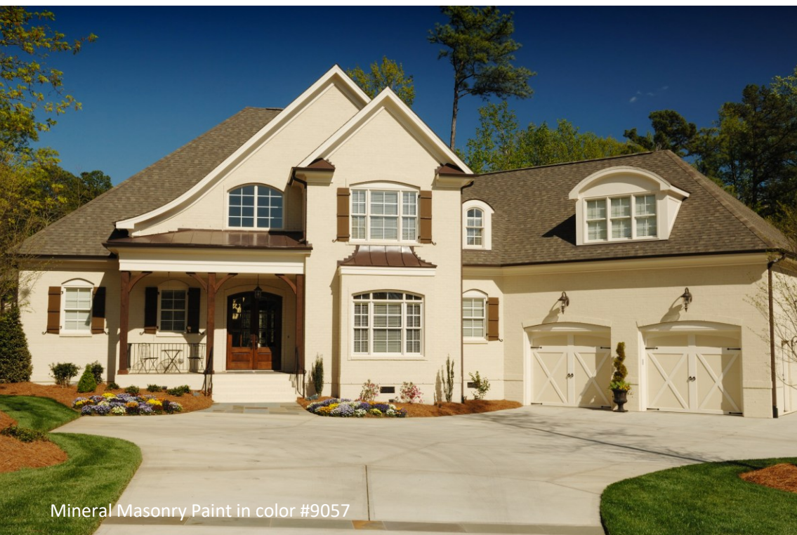
Mineral Masonry Paint in color #9057

Mineral colors are unique and color-fast. Keim uses only earthen mineral pigments that are U.V. resistant by nature's design. The pigments are inert and are not affected by even the harshest sunshine. And, like masonry, these colors are matte flat and never look artificial or "painted". Mineral paints even darken when wet from rain just like the masonry and brick of your home. Latex/acrylic paints are based on plastic resins and can have an "artificial" appearance on brick and masonry, and almost always have an angular "sheen" which is unnatural.