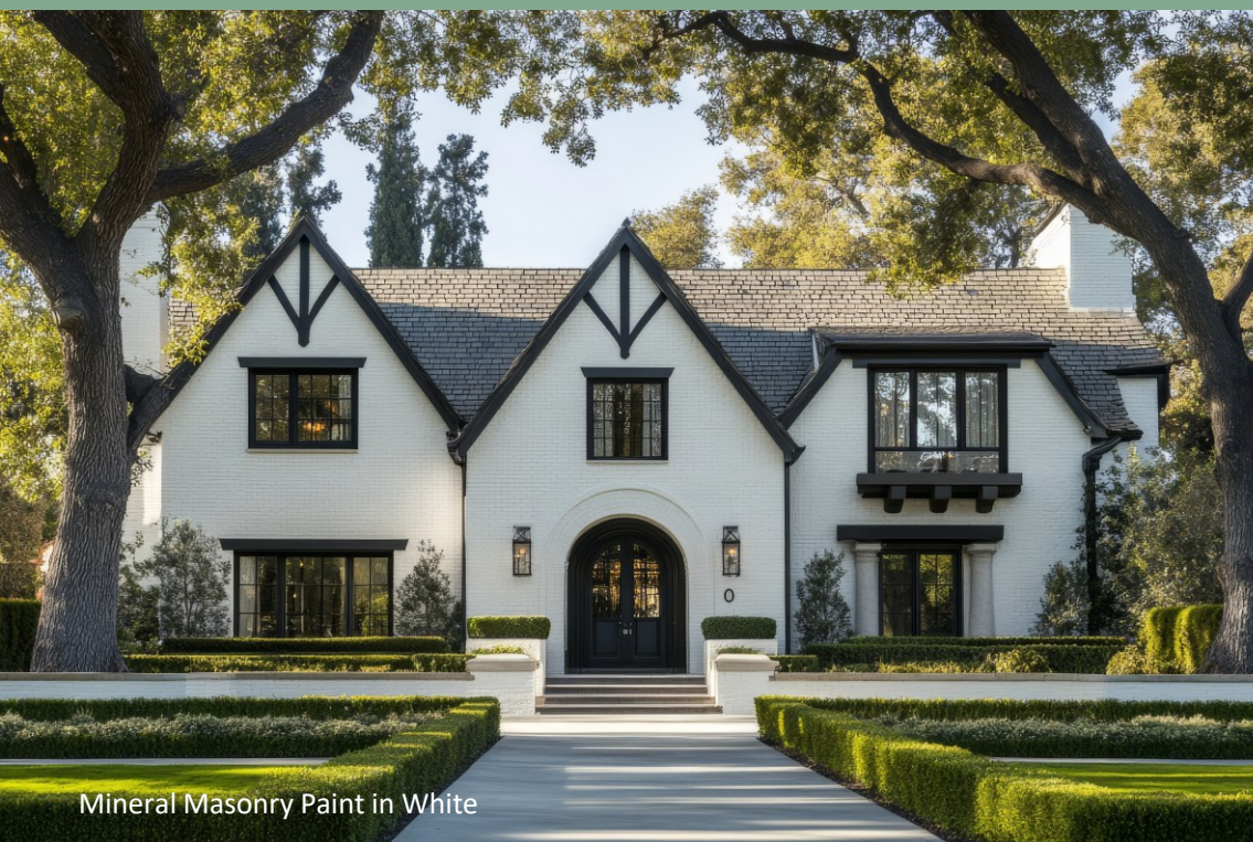
Mineral Masonry Paint in White

This extraordinary lifespan is due to the unique bond, a chemical fusion, of Mineral Masonry Paint and brick. Mineral paint's ingredients are naturally U.V. and weather resistant, just like stone in nature. Harsh sunlight, wind and even coastal rains have little effect on mineral paint. Your home's brick and masonry will be completely protected from the weather. Some Keim paints have lasted since 1881 and still look fantastic today!