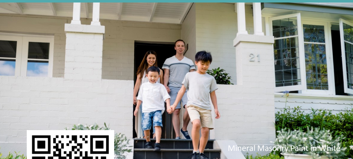
Mineral Masonry Paint in White

Don't suffocate your brick with ordinary paints. Keim Mineral Paints become one with the masonry of your home so bricks breathe easy. No blistering or peeling.