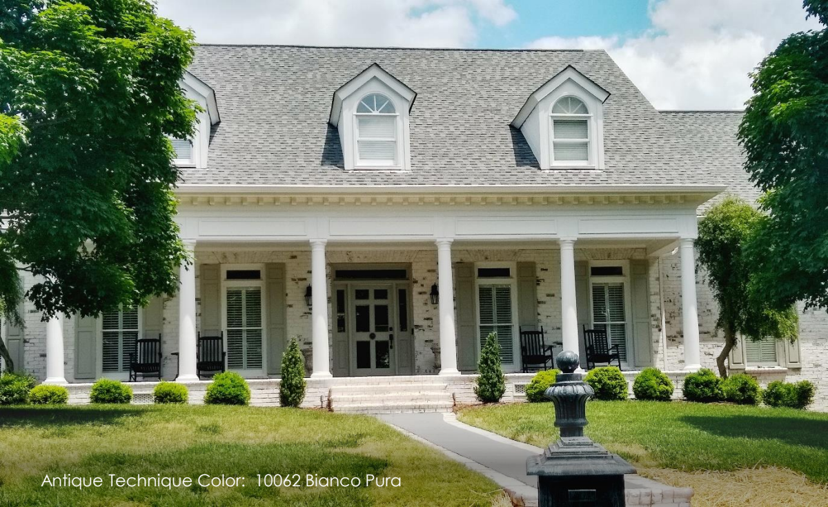
Antique Technique Color: 10062 Bianco Pura